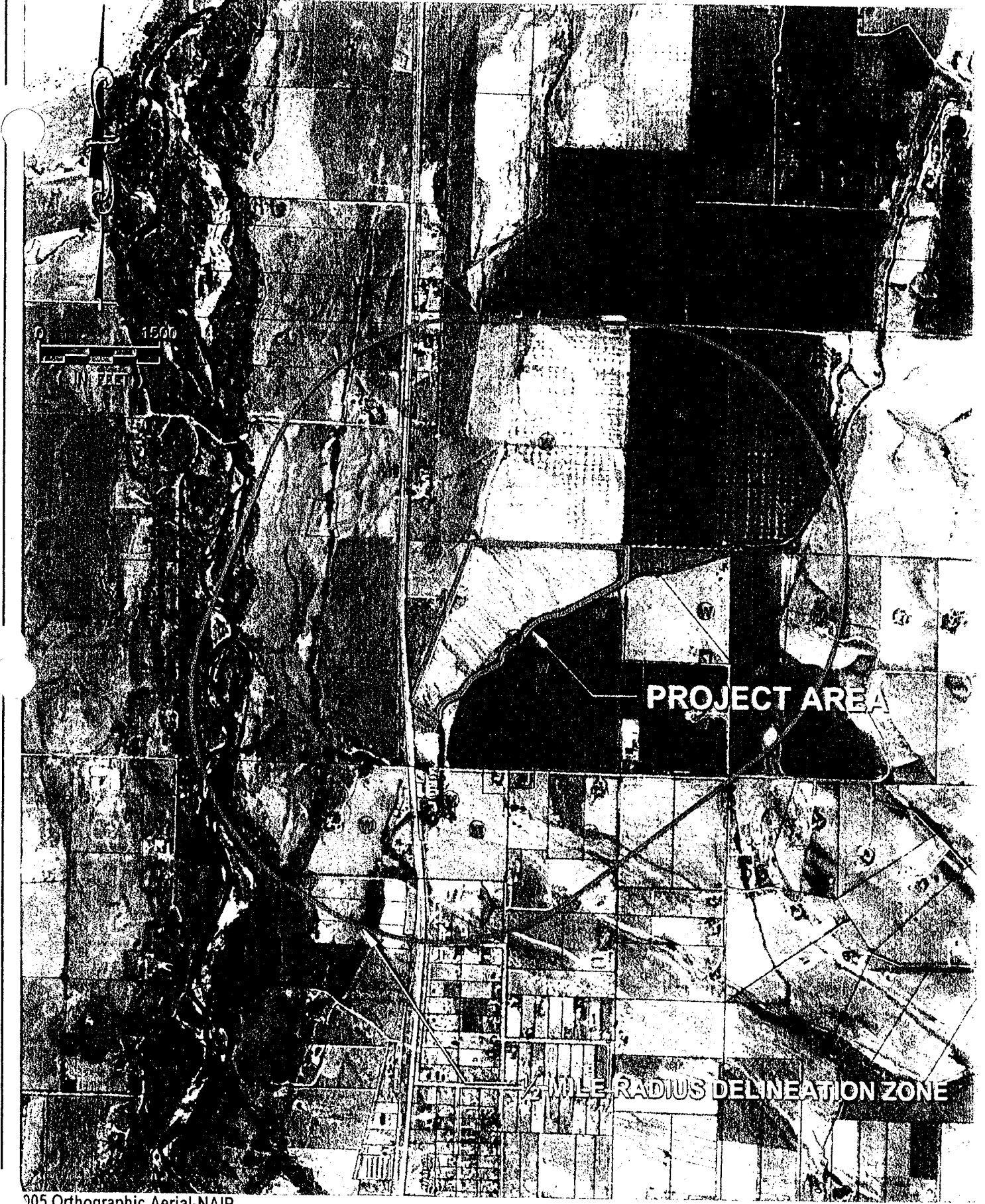
905 Orthographic Aerial-NAIP